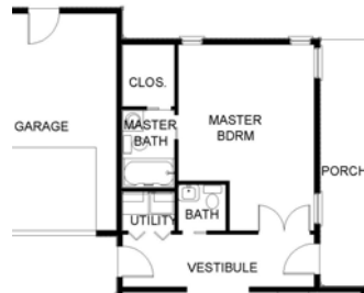
Opt. M/bed in place of Family Room